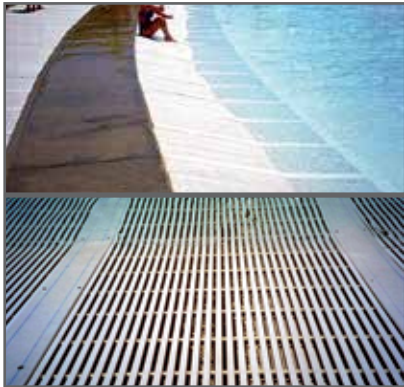
“The Beach” - Mandalay Bay

Safe-T-Span® pultruded grating, Fiberplate® and Dynaform® structural shapes were used to create this wave pool break. When the pool was originally built, the waves would wash up on the beach soaking everything in its path. The architects needed to create an area which would allow the waves to disperse and drain back into the pool. With it's corrosion- and slip-resistant and thermally nonconductive properties, Safe-T-Span is the perfect solution.