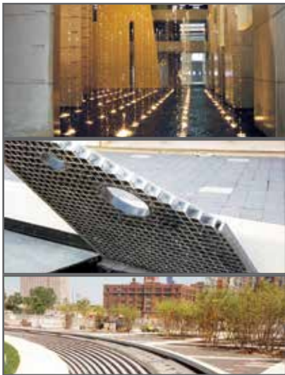
McCormick Place Fountain

When the city of Chicago decided to dress up their expanded and renovated convention center, McCormick Place, they chose Fibergrate® covered grating. The covered grating was used to create fountains in an outdoor 5-acre plaza (McCormick Square) and indoors in a 900-foot long Grand Concourse which also houses retail shops and restaurants. The light weight of the covered grating allowing workers easy access to pipes as well as excellent corrosion resistance make Fibergrate® the best solution.